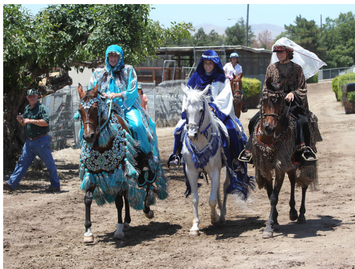
Arabian Native Costume riders at the Alameda County Fairgrounds for the Sheikh Zayed Cup