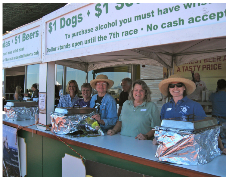
DAHA volunteers enjoy a perfect day at Golden Gate Fields

Our beer service ended at the start of the 7th race. The booth was cleaned up, and the last of the volunteers left the race track at 4:45-----having shared a fun day with old and new friends-----and very tired feet. Sunday's tips collected by DAHA will be donated to Horses' Honor, a non profit sanctuary for horses in need. DAHA earned $1,000 for working the booth for the day. Of the monies earned last year on Sept. 11, 2011, DAHA donated $500 to UC Davis Equine research facility and $500 to Horses' Honor. The use of this year's earnings will be determined at the Oct. DAHA board meeting.