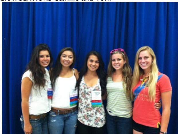
AHYA 2013 Youth Leadership